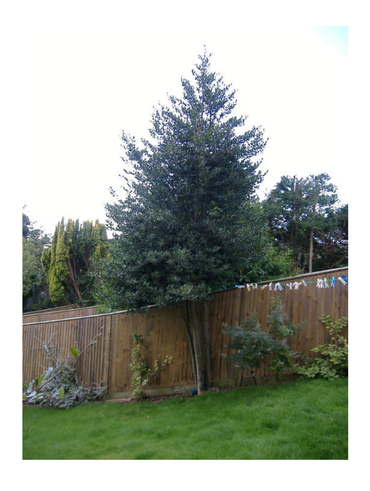
BH2008/02516 2a Croft Road Fagus sylvatica (Tree B)